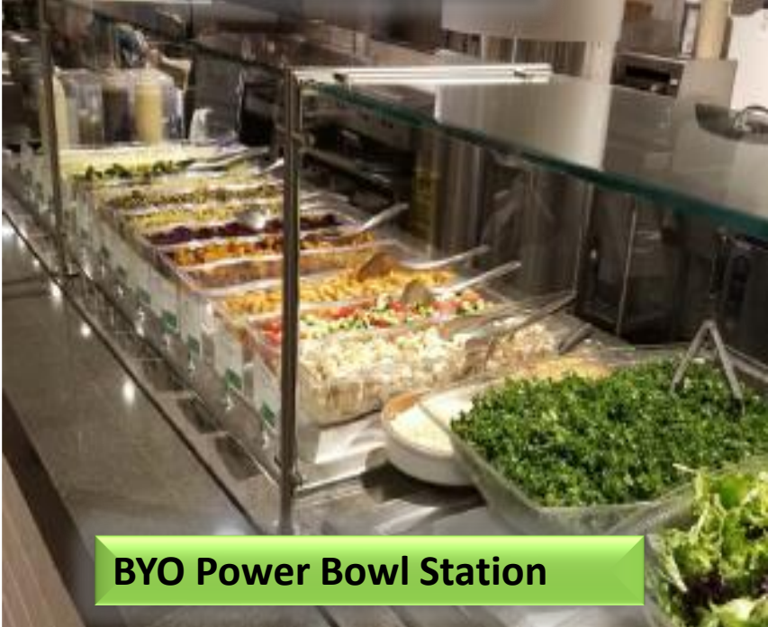
BYO Power Bowl Station