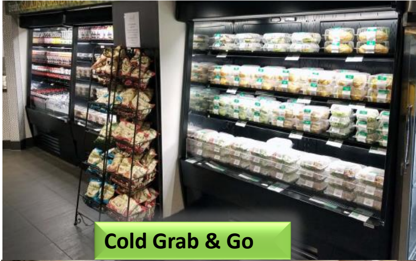
Cold Grab & Go